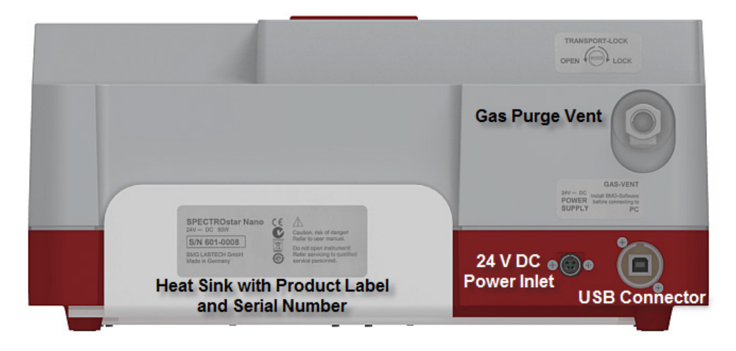
Figure 4: Backside view of SPECTROstar Nano

The backside of the SPECTROstar Nano depicts the power connector, the USB connection to a PC, and the gas purge vent to control the atmosphere inside the instrument (figure 4).