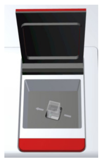
Figure 2: The SPECTROstar Nano Cuvette Port

Open the cuvette port by briefly pressing on the lever of the lid. The door opens automatically and shows the cuvette port. An arrow inside the cuvette port displays the direction of the light path. Hence a cuvette must be placed so the light can pass through (figure 2.). Close the cuvette port by pressing on the lid until it resides flat.