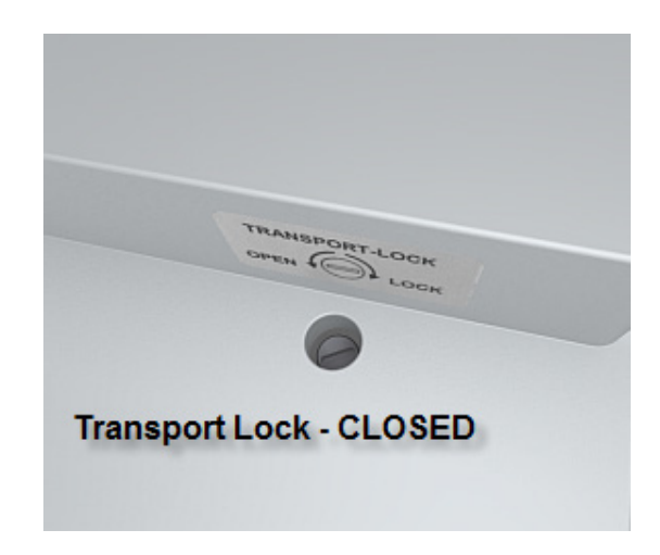
Figure 5: Transport Lock position